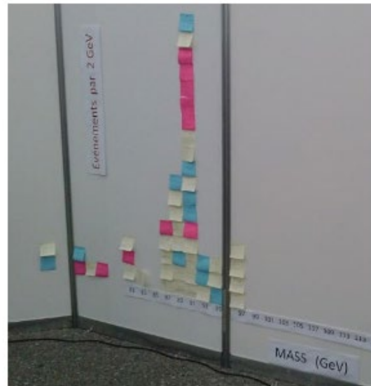
Mass plot of Z candidates.

For the W analysis , the W is charged; therefore, it can only create one charged decay product thus conserving charge. Students identify W candidates as those with only one muon or antimuon track. The decay also creates a neutrino; this conserves momentum. The neutrino is not directly detected. To find if the possible W particle is a W^+ or a W^- , students use the curvature of the muon (or antimuon) track. A track with clockwise curvature indicates the positive charge carried by the antimuon after its decay from the W^+ . An anticlockwise curvature indicates the presence of a muon decaying from the W^- . Students count and report the number of W^+ and W^- candidates. The total number of W^+ candidates divided by the total number of W^- candidates in the class yields a W^+ to W^- ratio. Students ignore the mass of these events.