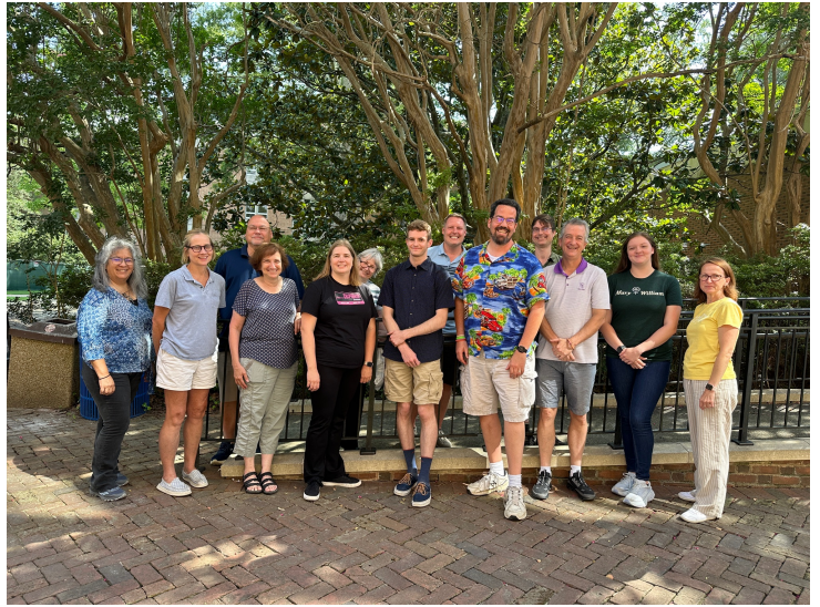
Fall Workshop (William & Mary)