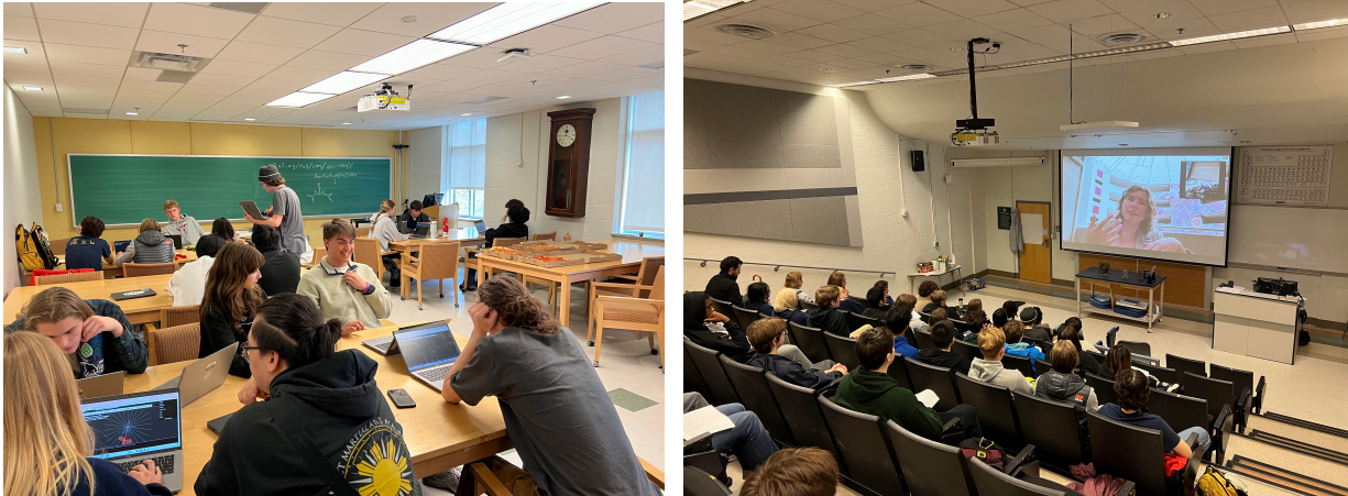
Students at Masterclass (William & Mary)

William & Mary hosted a CMS Masterclass on March 23, 2024 for around 35 students from VA and MD. In addition to the analysis of CMS data and videoconference with Fermilab, students listened to a talk about particle physics, interacted virtually with a former Masterclass student currently studying at CERN, and toured several hadronic physics and AMO labs, and a NOvA experiment control room.